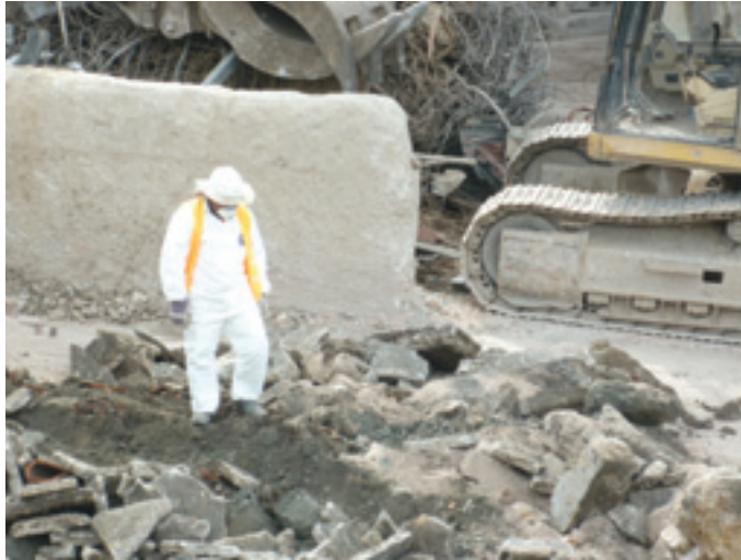
Second inspection – Asbestos sighted and wearing appropriate personal protective equipment

Recommended PPE for the removal of ACM includes: